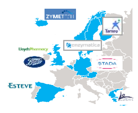
ColdZyme is sold in-house and through distributors and partners in Sweden, Denmark, Norway, Finland, the UK and Spain, as well as in Germany, Belgium and Austria beginning in 2017. An equivalent product under the PreCold brand is sold in Iceland by the acquired company Zymetech.

Enzymatica was founded in 2007, has its head office in Lund and has been listed on Nasdaq First North since June 15, 2015.