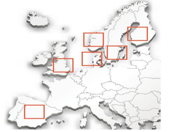
ColdZyme® is currently sold in Sweden, Denmark, Norway, Finland and the UK, as well as in Spain starting in January 2016.

Enzymatica was founded in 2007, has its head office in Lund and has been listed on the Nasdaq First North since June 15, 2015.